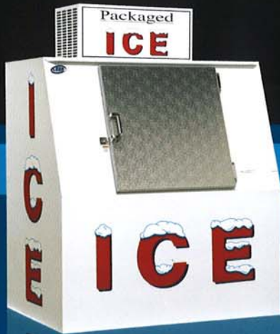
MODEL L40 SLANT

All Leer indoor merchandisers feature the finest cabinet construction assembled under the industry's toughest quality control standards. That means they'll be standing strong, ready to sell ice for many years to come.