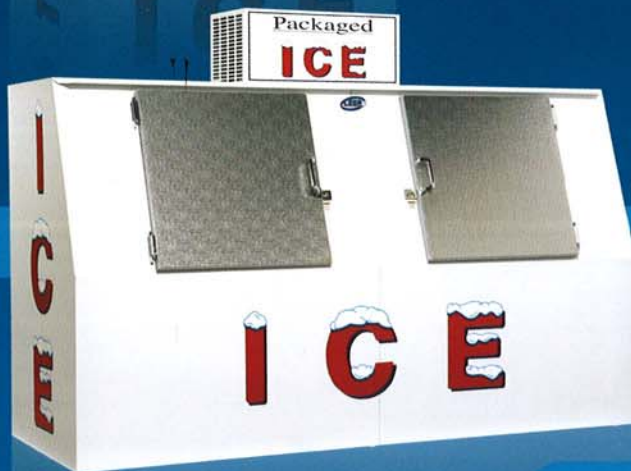
MODEL L75 SLANT