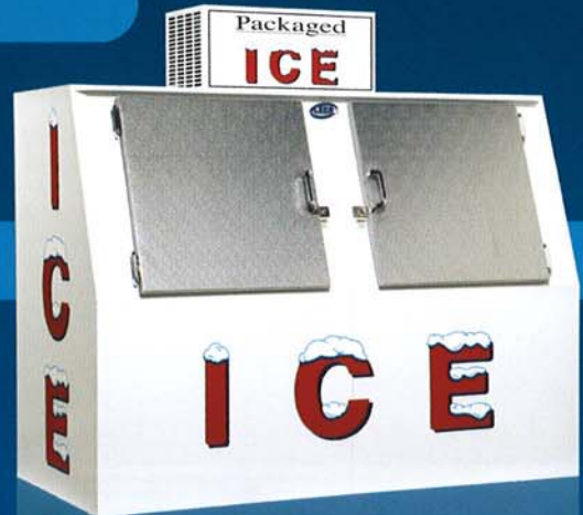
MODEL L60 SLANT